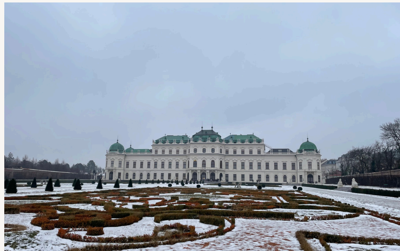
THE ART MUSEUM OF VIENNA